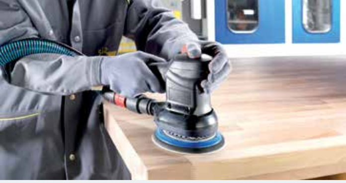
▶ Low scratch depth and high removal rates