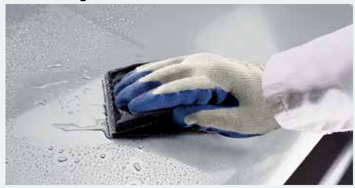
▶ Suitable for general use in dry and wet sanding applications