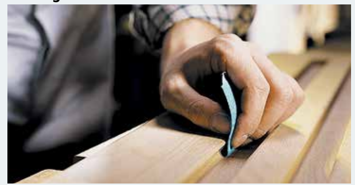
▶ Highly flexible with high tear resistant strength