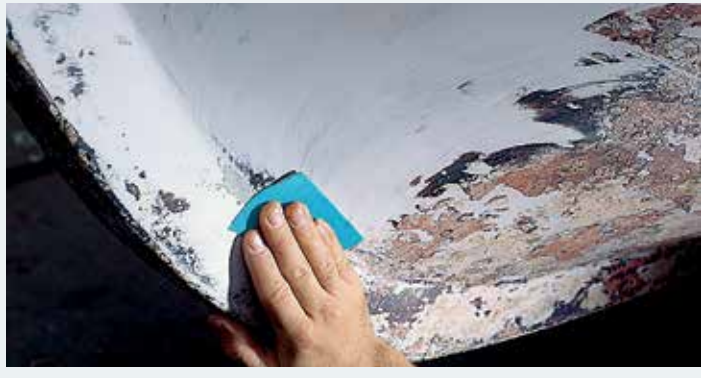
▶ Long lifetime